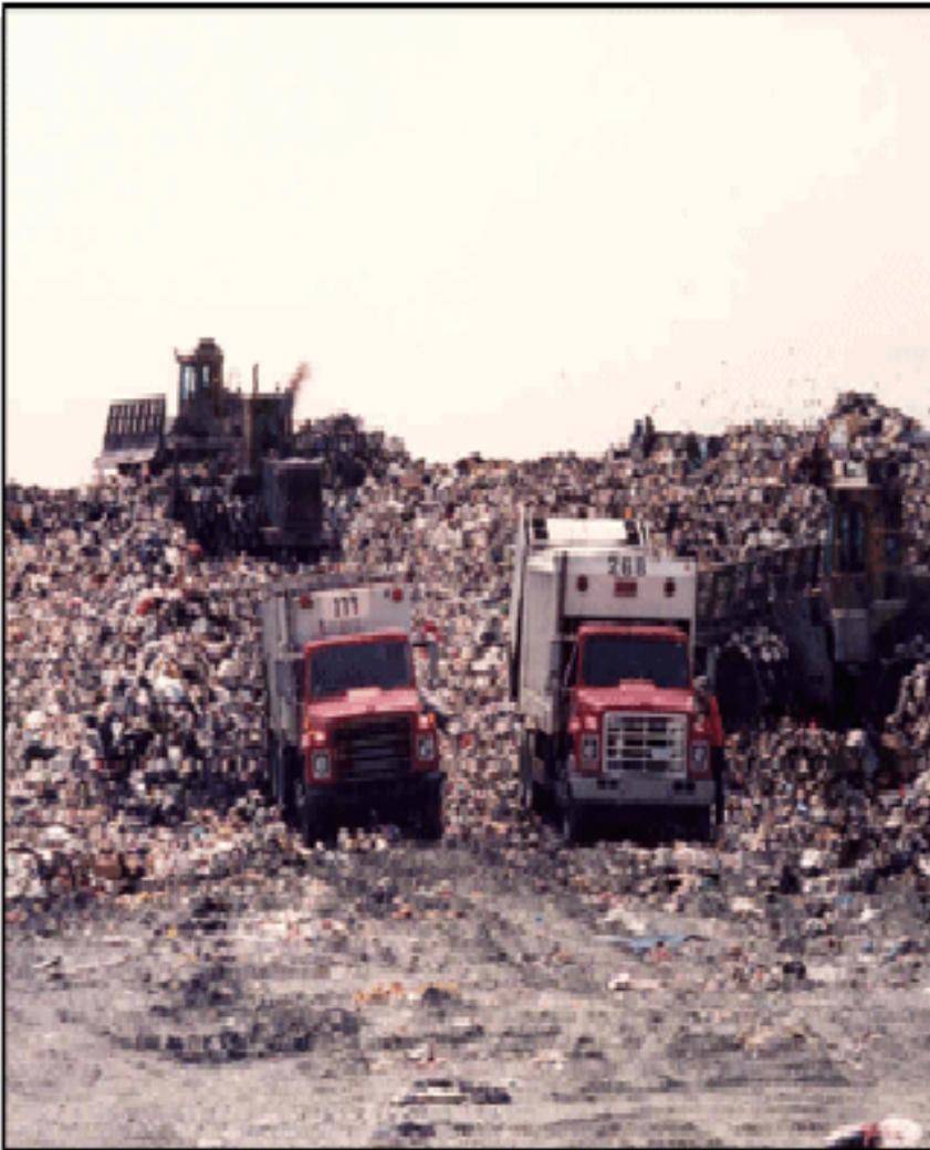
Trash by Volume in Landfills